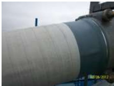
View of West side