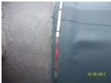
Band & seal East side